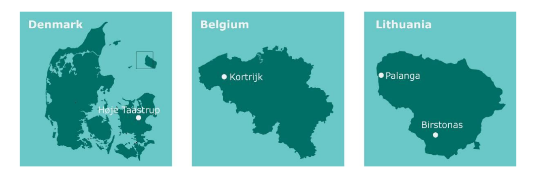
Figure 1: Maps representing the three ECO-Life communities

The average payback time for all the demonstrations in Denmark and Belgium are approximately 17 and 24 years respectively on the total investment of more than 40,000,000 million EUR before the EU support and 12-14 year after.